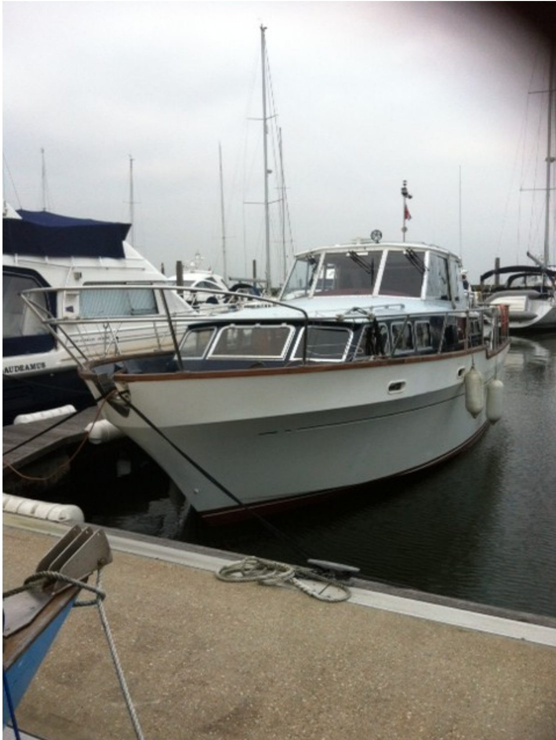
DAWN SHADOW RANGER 36 1977 CLASSIC MOTOR BOAT